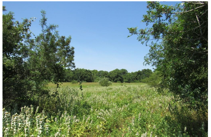
Tedrow-12.8 acres Rhome Texas, AC +/-