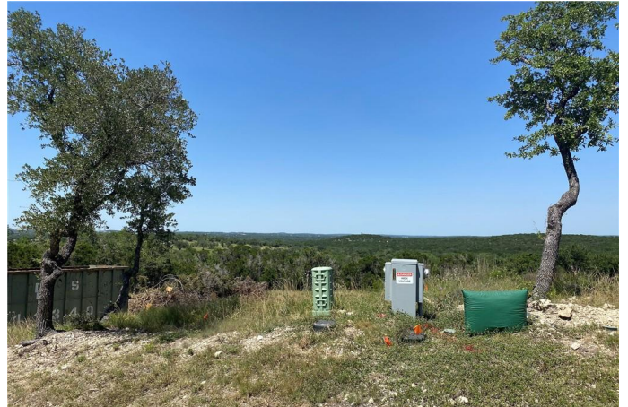
159 Raton Pass