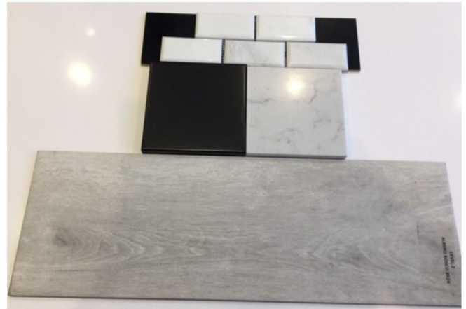
159 Raton Pass